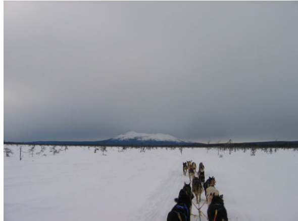
Trail to Takotna.

Sisco still isn't feeling well. He has more diarrhea and throws up again Just outside Ophir. This isn't a good sign and I may have to drop him. We passed some teams taking their 24 in Takotna and pull into Ophir at 8:00 PM in 77 th place. With Sisco feeling so poorly and several others not doing well I decide to stop in Ophir rather than blow through. I want the vets to take a good look at Sisco. They do and his lungs sound clear (we worry about aspiration pneumonia when they