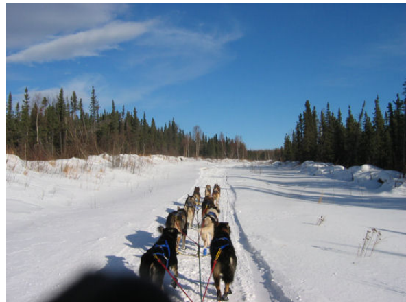
Beautiful day on the trail between Ophir and Cripple

As we come around a corner there is a set of used straw beds angling off the trail. I call the team onto the beds and shut them down. We should only be 3 or 4 hours from Cripple. A rest now,